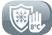
Home freezing prevention