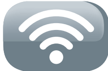
Wireless smart kit