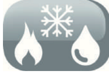
3 functions in 1