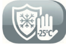
Extra frost protection in outdoor unit