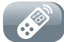
Remote control with LCD-display